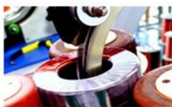
Primary winding Waterproof transformer winding

We are concentrating on manufacturing products