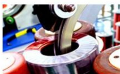
Primary winding Waterproof transformer winding

We are concentrating on manufacturing products