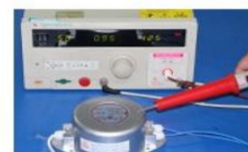
Spot test Waterproof transformer detection