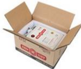
[Secondary Packaging] The middle Shockproof carton