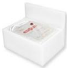
[Inner Packaging] With thick shockproof Special foam

Using thick shockproof packaging cartons, installed inside the foam packaging to avoid damage during transit