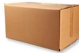
[Outer Packaging] Super thick Outside the carton